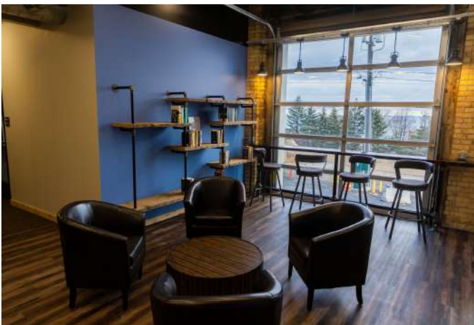
Collaborative team science space, library and kitchen, with views of Lake Superior