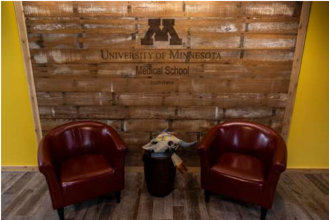
Entrance view, remodeled lower level

This is more than just a building. It is a place where connections are made, collaborative research is being done to improve dementia outcomes in Indigenous and rural communities and laughs are shared. We are growing and capable of so much more. Below are some pictures of our newly renovated office space, which added 8,000 square feet of space for research and collaboration.