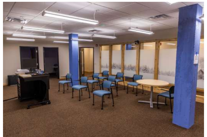
Community-based participatory research training lab, remodeled lower level